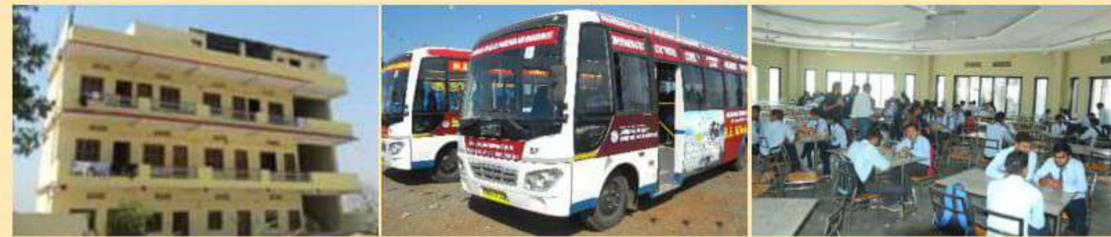
Boys & Girls Hostel Bus Facility Canteen