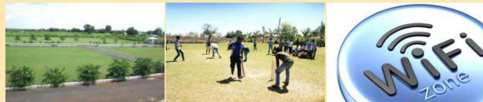
Campus Beautification Sports Facility Wi-Fi