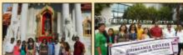
International Tour to Thailand

More than 100 Research Papers published by the teaching staff of Wanganga College of Engineering and Management.